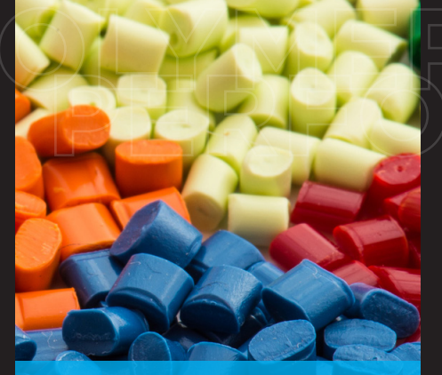
Which base resin gives the performance I need?